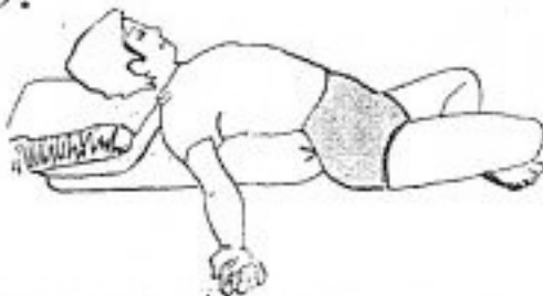
Supta Swastikasana. 5 minutes.