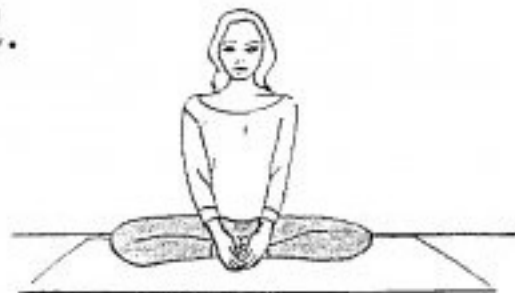
Baddha Konasana - sitting upright with wall or chair support. 5 minutes.