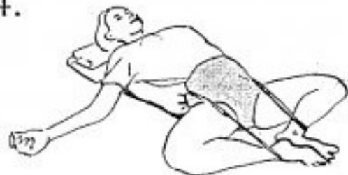
Supta Baddha Konasana, with belt around sacrum and feet. 5 minutes.