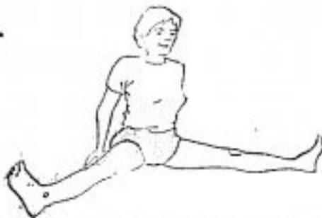
Upavistha Konasana - sitting upright with support of the wall. 5 minutes.